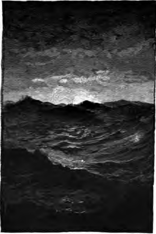
"The holy twilight fell upon the sea." Page 296.